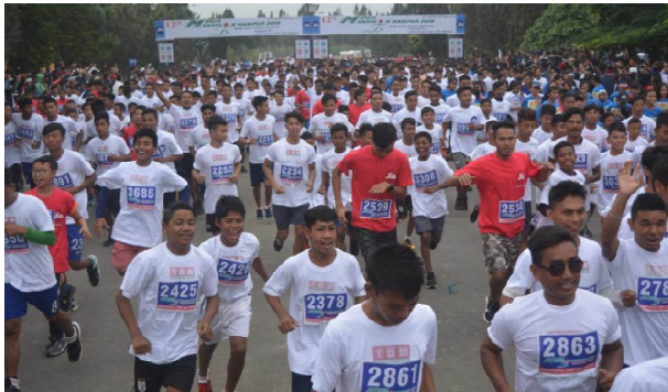
ITNews Imphal, Nov 4.